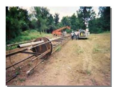
1 of 8 O-cell tests ready for placement