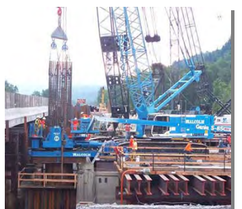
emporary Bridge Constructed by Hamilton