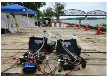
New World Record Test Set-up