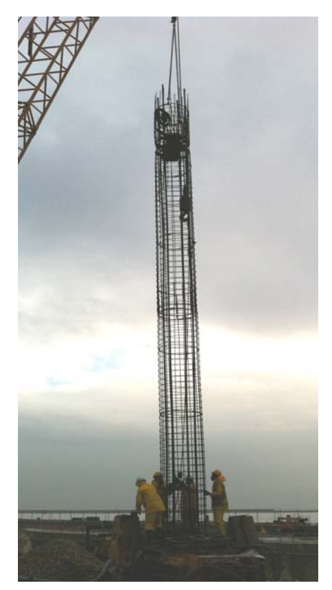
Installation of the O-cell cage