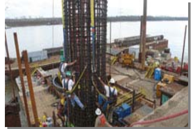
Insertion of rebar cage and O-cell assembly