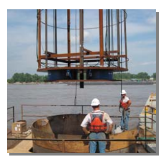
O-cell Assembly Placement

I-70 Bridge over the Mississippi River St. Louis, Missouri Massman, Traylor Bros. and Alberici, JV