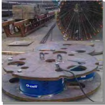
Three 6000 kip O-cells Assembled with Plates