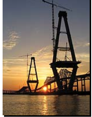
The bridge's 1,546-ft main span is supported by two 575-ft-high, diamond-shaped towers

Project Location Client Period Project Description