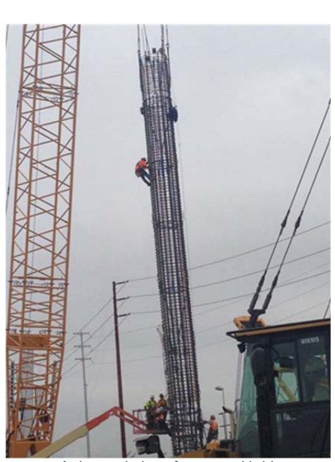
Artist rendering of proposed bridge