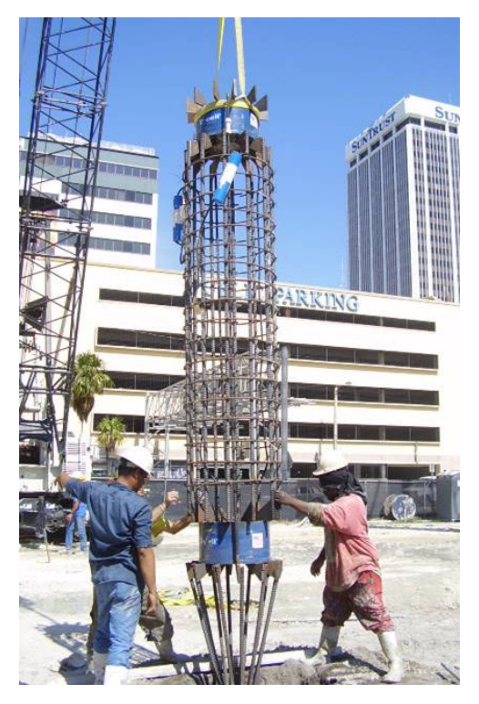
Assembly of a multi-level O-cell arrangement

The ground conditions on these projects are typical for Florida, comprised primarily of a thin deposit of fill, sand or shore deposits, followed by a soft oolitic limestone of the Miami Formation.