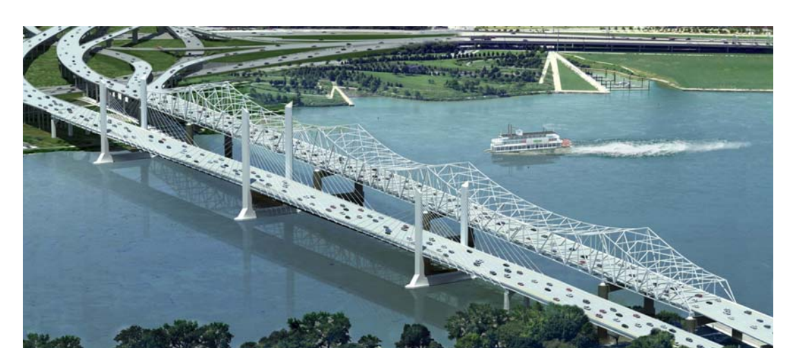
Rendering of Downtown Crossing

Using the O-cell technique it is possible to achieve very high average unit skin friction and end bearing resistances in hard rock formations. This allows the design to be optimised, resulting in shorter rock sockets, more economical foundation construction and reductions in program time.