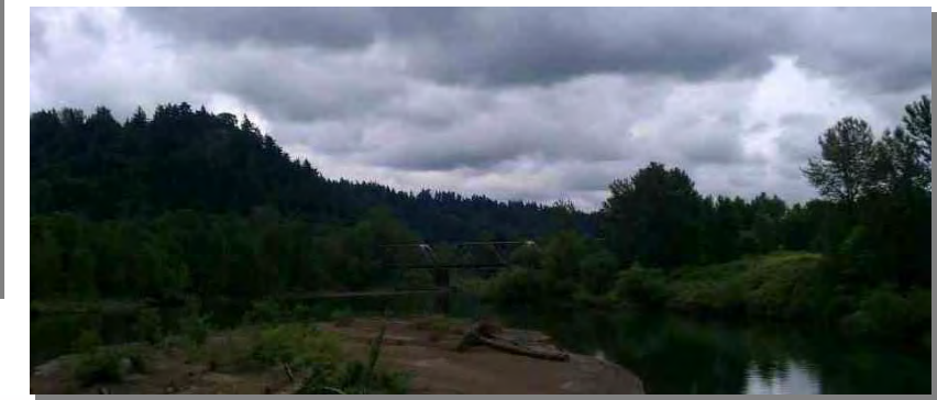
Looking at a Railroad Bridge From the Temporary Work Bridge.

Loadtest's strength, which is to provide definitive full scale load movement, and unit shear and end bearing data on very highly loaded deep foundation elements, proved invaluable for this project.